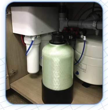
25020189 Kit, Tank, Recirculation, H.E.R.O.™

Applied when the H.E.R.O.™ is installed under a kitchen sink or in a slab home without a basement. This tank provides blending of the HERO recirculated water and helps keep the system operating at its peak performance.