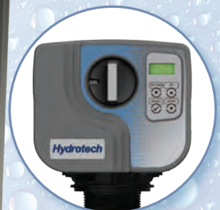
Also available with 765 valve