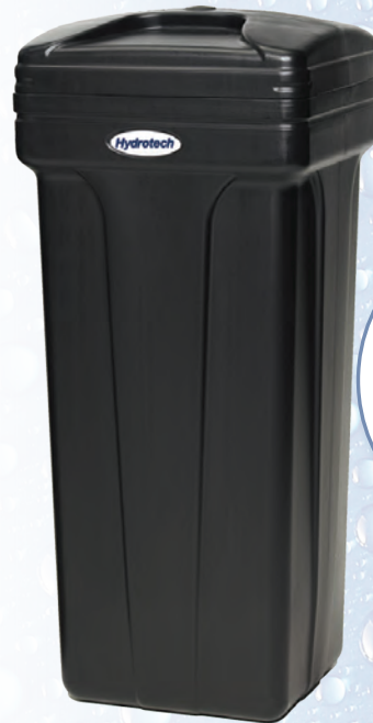
Brine Tank Included