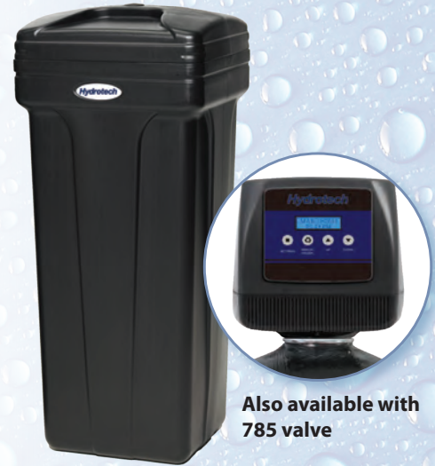
Also available with 785 valve