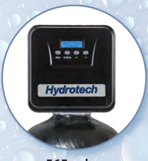
565 valve Simple user friendly 2 line /32 character display