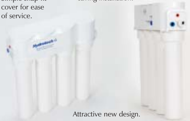
Attractive new design.

New slim profile with integrated mounting bracket for easy, space saving installation.